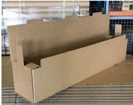
Single roll box