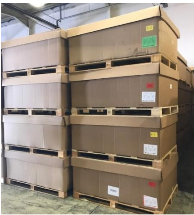
Standard box – stacked 4 high