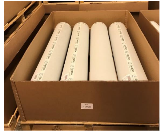
8 rolls of material in a box