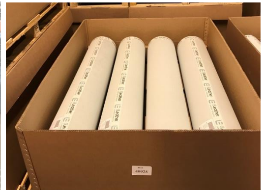
8 rolls of material in a box