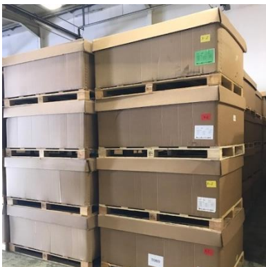
Standard box – stacked 4 high