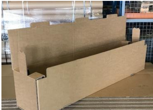
Single roll box